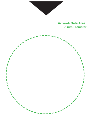
(approx print size)